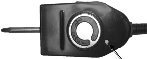
Power / Temperature Indicator Light